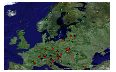
Figure 2. Sampling sites and proportion of individuals belongig to distinct clades. Colors in the pie charts correspond with the colored branches in Figure 1.